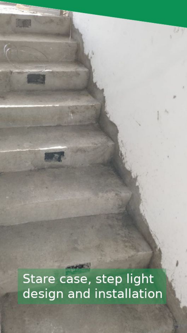
Stare case, step light design and installation