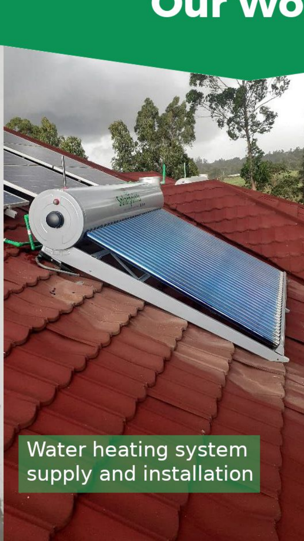
Water heating system supply and installation